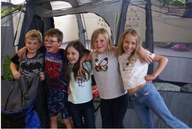
The Year 2 students enjoyed their sleepover last week.