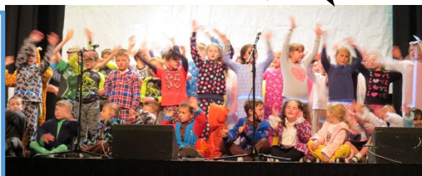
Some Concert practise pictures