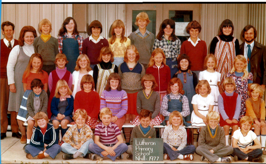
Nhill Lutheran School 1977

Support staff members include a Pastor, a Teacher Aide, a specialist Performing Arts/ Music teacher, a specialist Karen Language teacher and a Secretary. Music teachers visit the school to provide tuition in guitar, bass guitar, piano and keyboard.